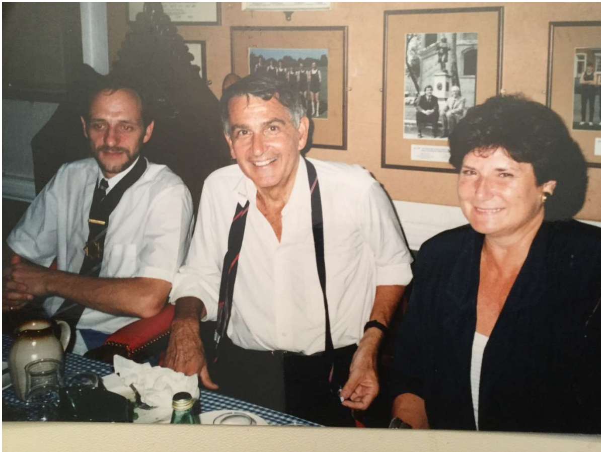
The great Ron Clarke at the Clubhouse in the 1990s (in Mexico temperatures)